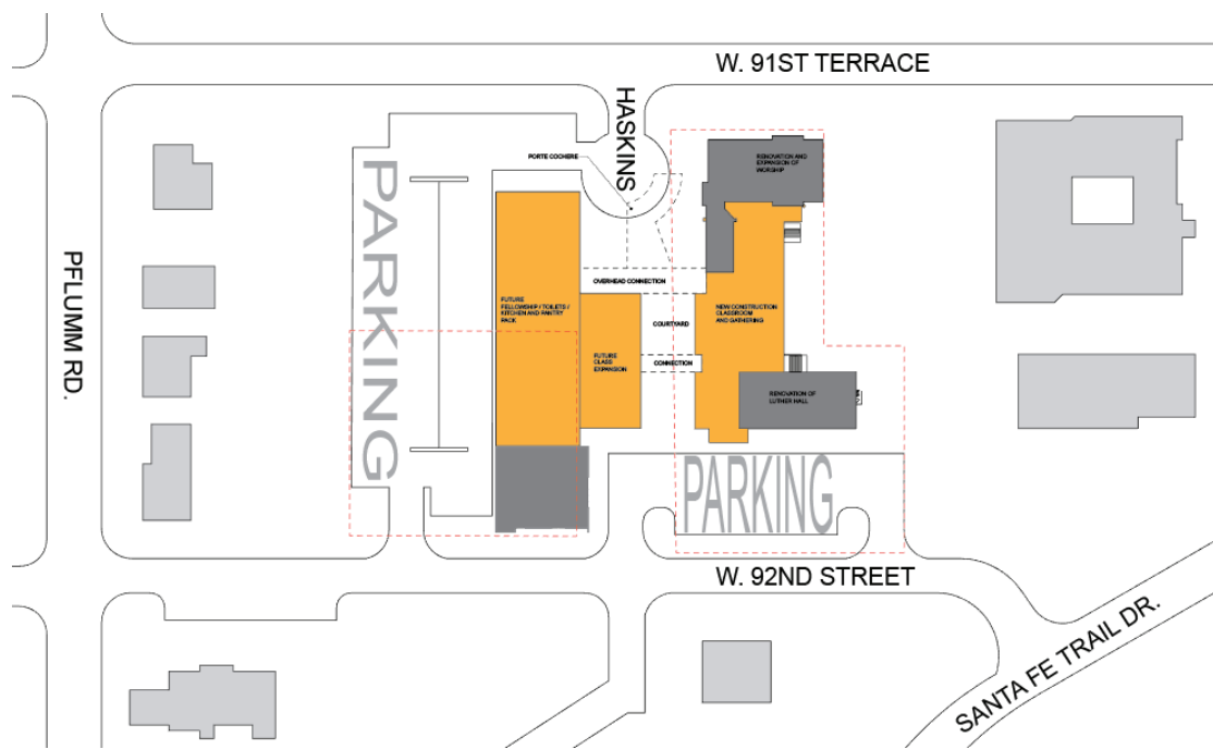
Site Layout – Concept 3 N ↑

The existing buildings on site will remain. Renovation of each building is proposed, while constructing connection pieces to house classrooms, worship, fellowship and support spaces. Below is a diagram that provides proposed new construction versus renovation.