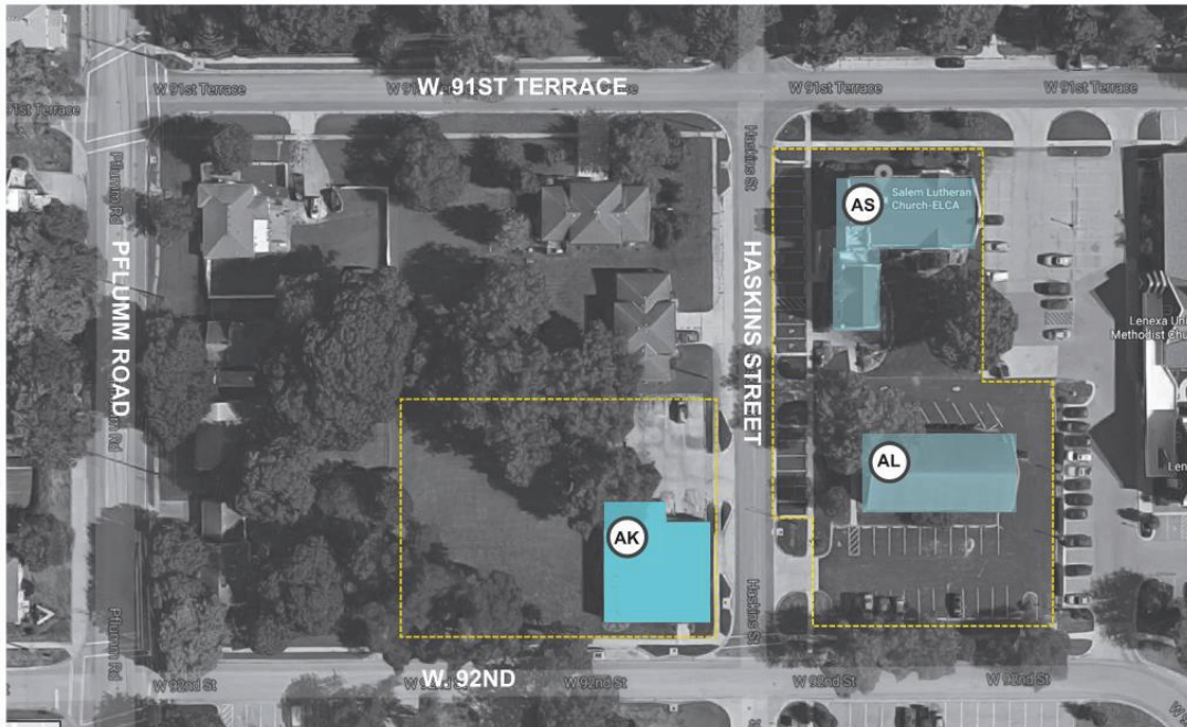
Salem Lutheran Campus N↑

The site was analyzed and site plan layouts were produced. The following outlines the process that was determined to be the most appropriate site layout that were to move into the next phase, Concept Design Options.